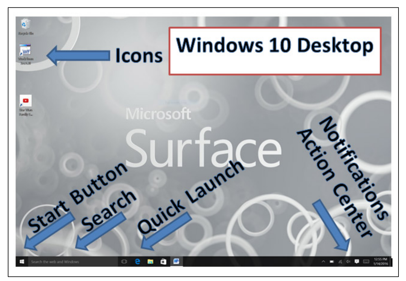
See descriptions of sections on next page

On the surface, the Windows 10 desktop is very similar to the Windows 7 desktop. It contains all the functionality of the Windows 7 desktop, and morphs to something more similar to Windows 8 the further into it you delve.